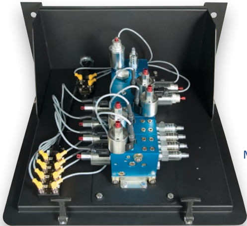
Modular manifold valve assembly