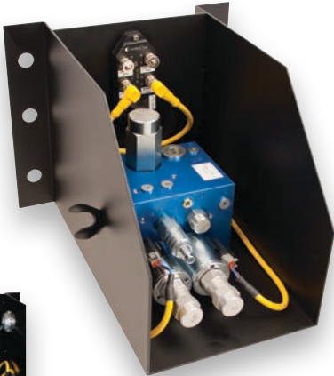
Spreader block enclosure