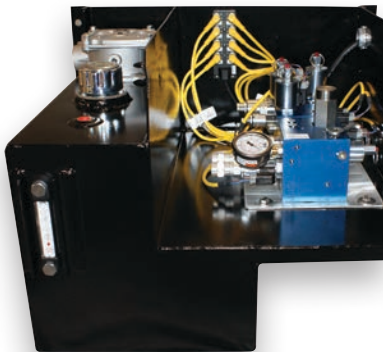
Powder coat reservoir/enclosure combo