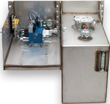
Stainless steel reservoir/enclosure combo