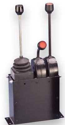
Lever (cable) controls