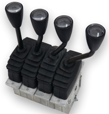
Lever (air) controls